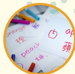
Pictured: Homemade Flash cards

Bilingual Boost: Engage in active recall, nourish vocabulary, and encourage conversation around each card.