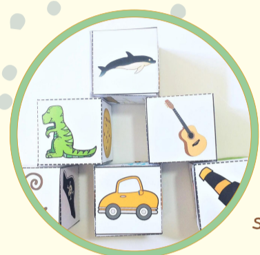
Pictured: Homemade Story Cubes