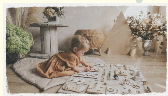
Pictured available on Etsy, @BusyBabyLV

Bilingual Boost: Children learn nouns & adjectives in multiple languages to describe textures.