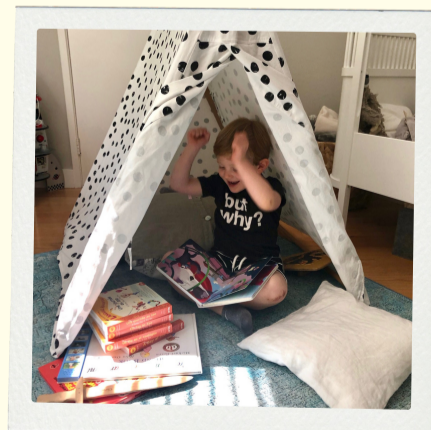
Pictured: A little boy enjoying TA-DA!'s 'Language Adventures' Series

Bilingual Boost: Vocabulary building and both visual and aural story-rich details allow for a rich language immersion experience.